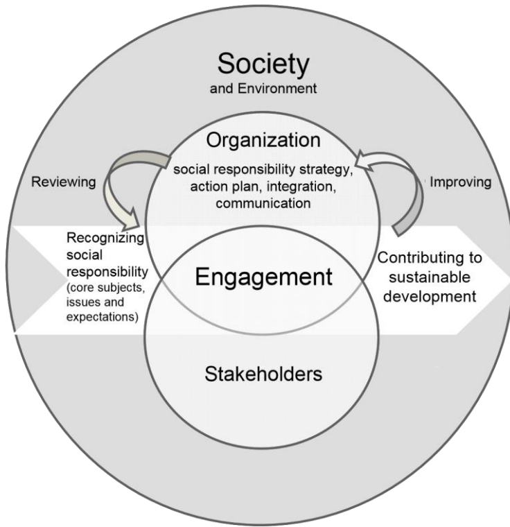
Figure 4 — Integrating social responsibility throughout the organization